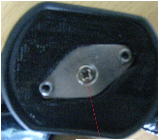
Inside View: Screw holding the stop