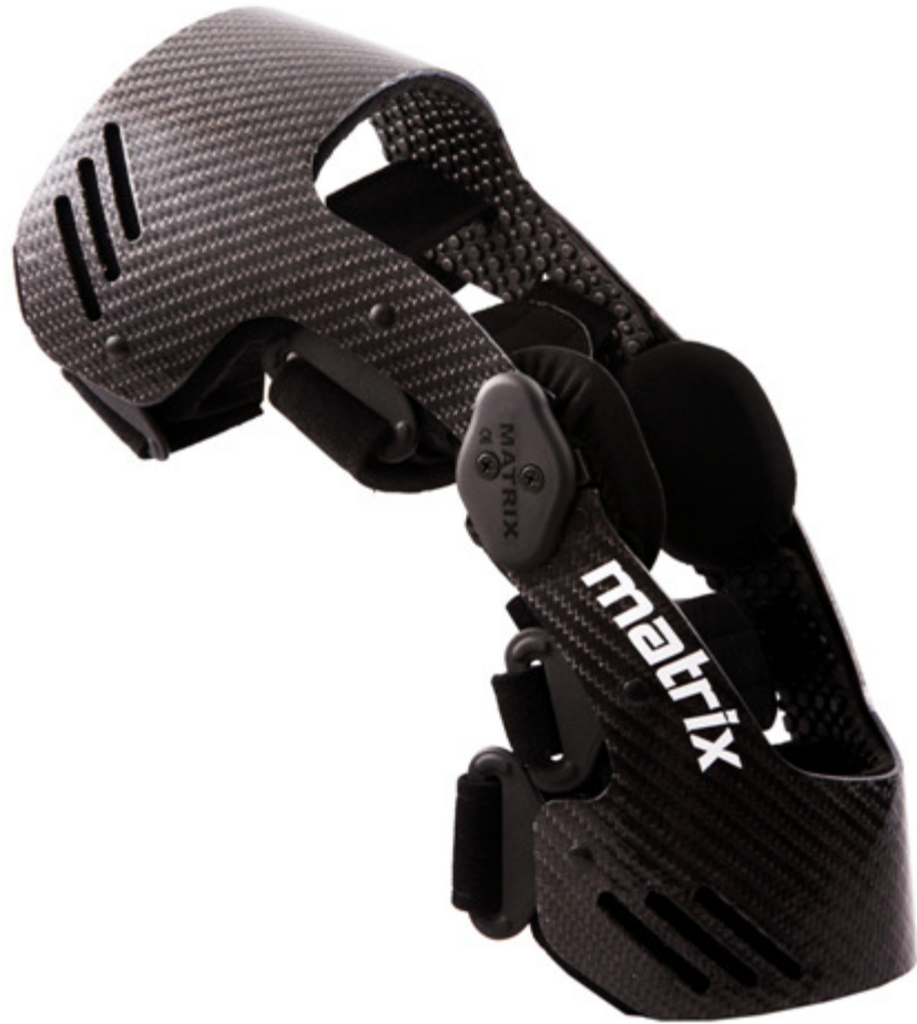
MATRIX LITE KNEE BRACE