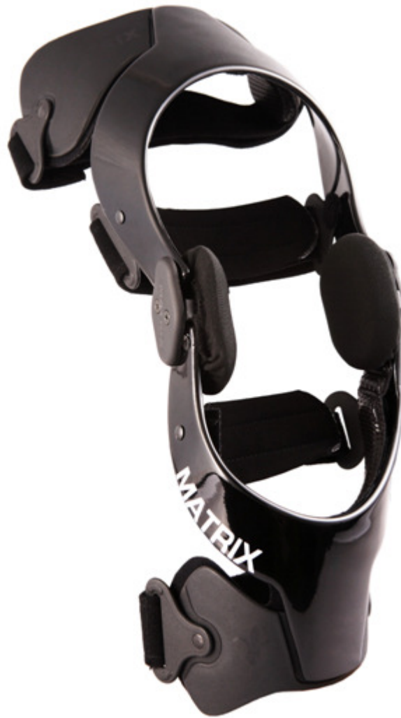
MATRIX PRO KNEE BRACE